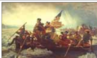
George Washington Crossing the Delaware by Emanuel Leutze, 1851

Stop by the library October 1-November 28 to see the exhibit Picturing America , featuring 40 reproductions of notable American art focusing on our nation's history and culture. The exhibit comes to Bemis as a result of a new initiative from the National Endowment for the Humanities to bring masterpieces of American art into classrooms and libraries nationwide. The exhibit will be located on the lower level of the library.