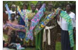
Lovely tie-dye scarves from Uganda.

An array of handmade craft items from around the world will be available for purchase at Bemis on Saturday, October 18, 1:00-4:00 p.m. Items for sale will include handmade Russian craft items, olive-wood carvings from Palestine, beautiful tie-dye scarves and beaded jewelry from Uganda, Bulgarian jewelry with stunning natural stones, crafts from El Salvador and from Ten Thousand Villages, an organization that works with over 100 artisan groups in Asia, Africa and Latin America.