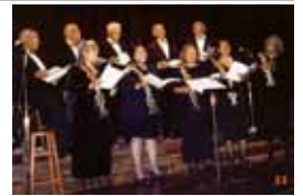
Grand Design Chorale

Sit back on the front lawn of the library and enjoy a high-energy performance of African drumming and dance performed by the Black Hand Drum Ensemble, as well as songs and spirituals from Black history sung by the Grand Design Chorale, Thursday, August 13, 6:30-7:30 p.m. The eighteen-member Chorale has performed throughout the Denver metro area.