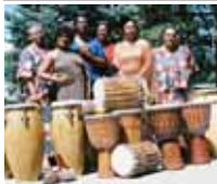
Black Hand Drum Ensemble

Sit back on the front lawn of the library and enjoy a high-energy performance of African drumming and dance performed by the Black Hand Drum Ensemble, as well as songs and spirituals from Black history sung by the Grand Design Chorale, Thursday, August 13, 6:30-7:30 p.m. The eighteen-member Chorale has performed throughout the Denver metro area.