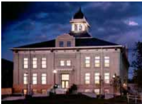
The restored Littleton Municipal Courthouse was rededicated in 2000

After World War II, the post-war housing and freeway construction boom caused some of the city’s old structures to be abandoned. The city, bolstered by concerned community volunteers, saw value in the old buildings, rescued some of them, notably the wooden-frame Santa Fe Railroad Depot, which became an art center for the Littleton Fine Arts Guild. The stone Denver & Rio Grande Depot was renovated and now serves as the crown jewel station of RTD’s Southwest Light Rail line. In 1998, an extensive restoration project began on the abandoned former county courthouse, and in May 2000, the city rededicated it as the new Littleton Municipal Courthouse. Other restoration projects in Littleton include the old Town Hall, which was restored and converted to a performing arts center and gallery. Reuse of historically significant buildings by saving them from demolition has long been part of Littleton’s history.