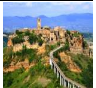
Civita di Bagnoregio, Italy