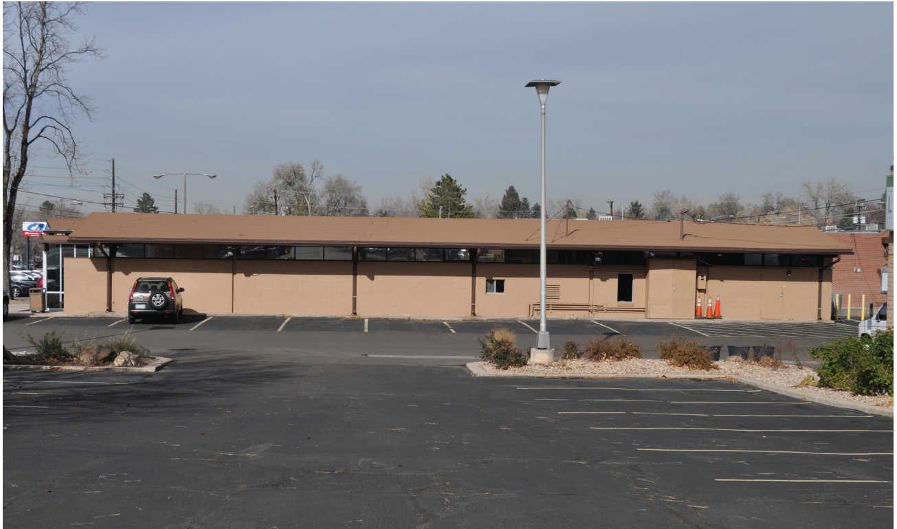
Photo: 5804 SDS 04.jpg South Wall (left); West Wall (right), detail of main entry area.